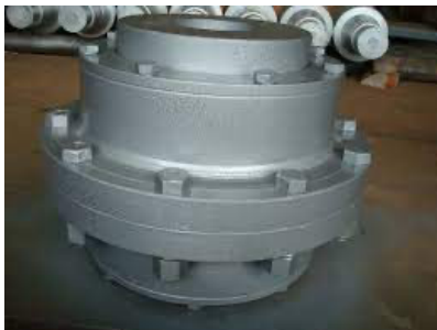
HEAVY GEAR COUPLING